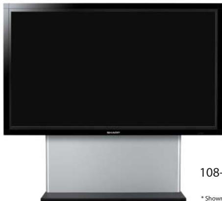
108-inch Full High-Definition LCD Monitor

* Shown with the stand cover (PN-ZS1C) which is sold separately.