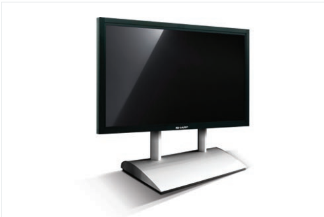
SHARP 108" LCD MOUNTED ON MOTORISED SCREENLIFTER