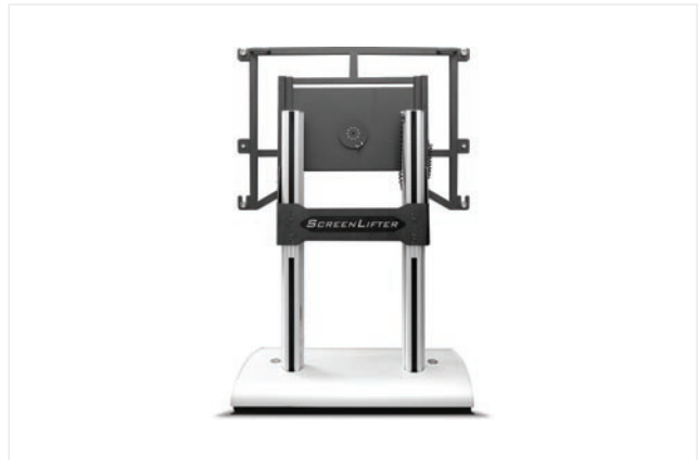
MOTORISED SCREENLIFTER UNIT FOR SHARP 108" LCD